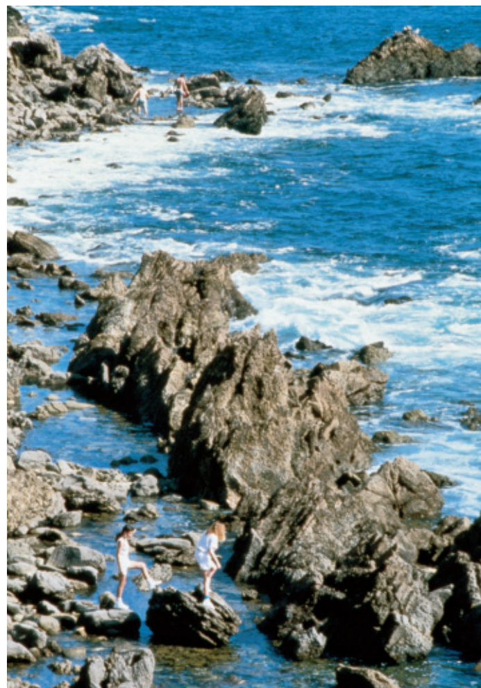
Tide Pools, Newport Beach